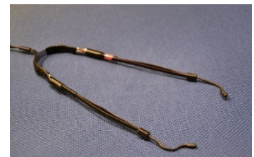
<In-ear audio microphone system>

JVCKENWOOD newly developed an ultracompact in-ear audio microphone system using a MEMS microphone to measure the individual characteristics of users. The ultracompact microphone system put in the ear canal space makes it possible to accurately measure the shapes of head and ears as well as sound field characteristics in the ear canal of users. By enabling users to easily fix the position of the microphone system they are wearing to the ideal measurement location regardless of the individual difference in the shape of ears, we achieved stable and highly accurate measurement. In this way, we succeeded in providing a listening experience with a natural sound field in open-back headphones as well as closed-back headphones, for which the conventional out-of-head localization was considered relatively ineffective in reproducing natural sound.