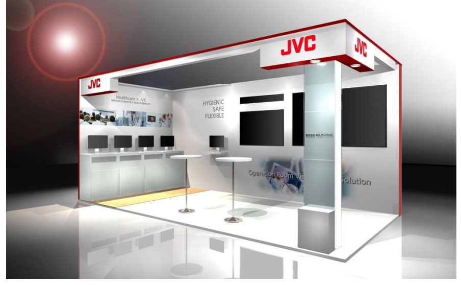
Conceptual Image of JVCKENWOOD Booth

In addition, we will prepare a reference exhibit of the KooNe high-resolution sound space design solution that brings a sense of security to operating rooms, as well as a one-plug fiber solution (VoIP) that supports advances in imaging information.