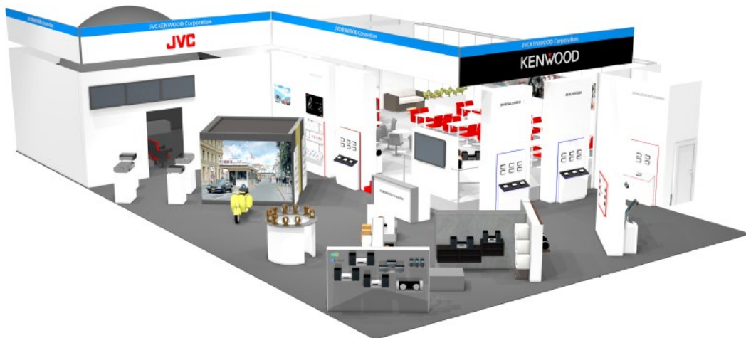
Conceptual image of the JVCKENWOOD

Our booth this year will showcase a diverse lineup of car electronics products that continue to have large shares of the European market, as well as new lines of portable home audio systems and wireless headphones that are ideal for a wide range of listening situations. Our booth will also feature a demonstration of 8K high-definition video images using a home theater projector and realistic video images using a dome theater.