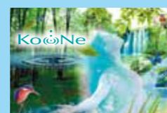
KooNe Space Sound Design Solution