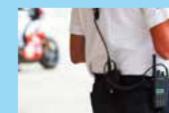
JVCKENWOOD's DMR-compliant digital radio communications systems adopted by MotoGP™