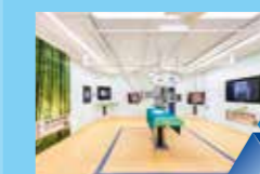
Advanced OR imaging solutions by Rein Medical GmbH