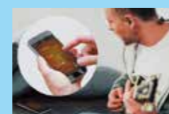
Multi live monitoring earphones developed using a crowdfunding service