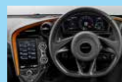
Digital cockpit systems