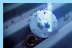
Diagnostic equipment using optical disk technology (DVD/Blu-ray)