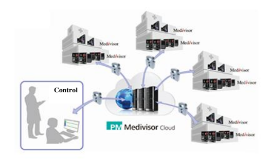
<Conceptual image of PM Medivisor

We will exhibit PM Medivisor Cloud, a cloud-based quality control software solution for medical image displays. PM Medivisor Clud continuously collects, analyzes, and stores data on the operational status of medical display monitors installed in hospitals, and reports the findings back to the system administrator. PM Medivisor Cloud can check the quality status of display monitors both inside and outside hospitals, making them maintenance-free, achieving significant streamlining of operation control work and reductions in maintenance costs. In addition, the solution